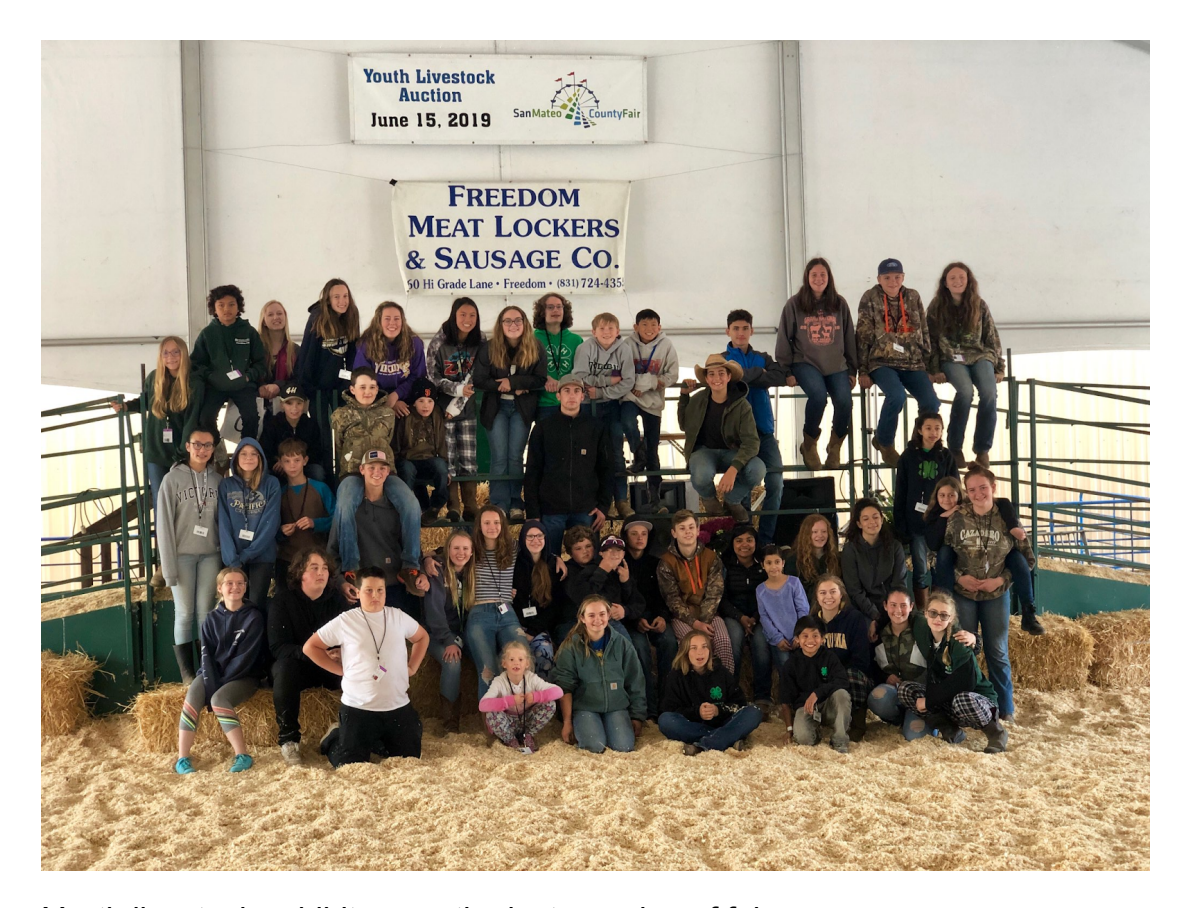
Youth livestock exhibitors on the last morning of fair

The last day of fair included the All Fair Youth Awards, the last round of chores, and the closing of the livestock barn. Congratulations to everyone who took part in this year's fair and thanks to all the families who came to join in the fun.